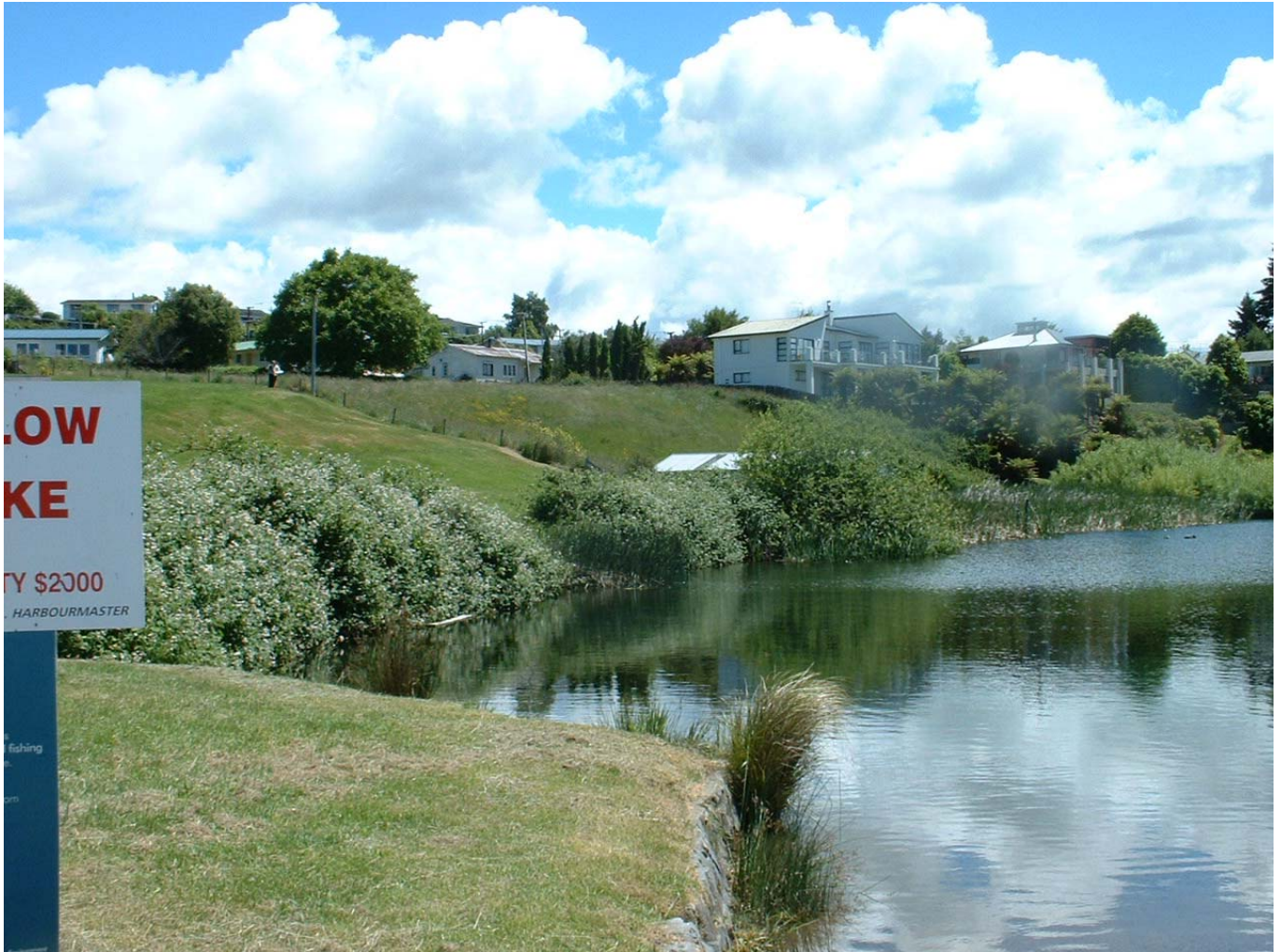
View of reserve river bank looking north from the boat ramp

An area of Raupo, to the north of the boat ramp, is of significance to local hapu.