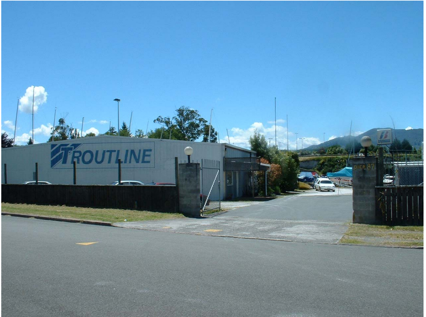
Pier 87 viewed from Rauhoto Street

On the corner of Noble Street and Rauhoto Street there is also a grassed area leading down to a sandy beach and the river. This is legally part of the road reserve but is regularly used by local residents and has particular cultural significance to Hapu as a swimming area and passive recreation area. It also provides views across the harbour mouth. A stormwater drain discharges in the northern corner of this swimming beach and a water supply line runs under the land and river from the Landing Reserve.