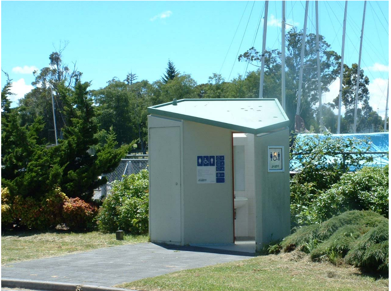
Reserve public toilet facing Rauhoto Street