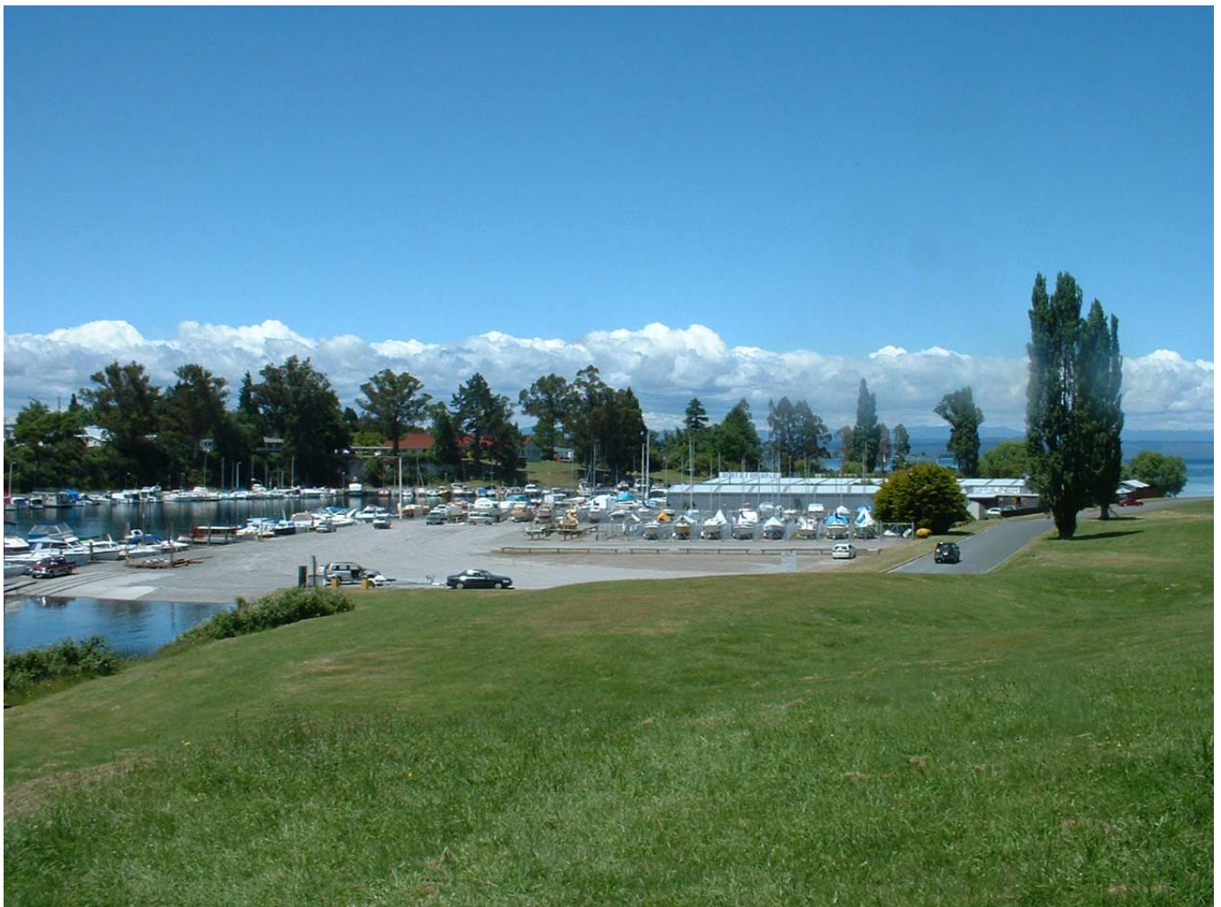
View of Nukuhau Boat Ramp Area Reserve towards Lake Taupo

The predominant neighbouring land uses are residential and commercial boat sale and maintenance type businesses to the north, west and south with the Waikato River, Tongariro Domain and Taupo's Central Business District (CBD) to the east.