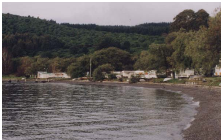
Photo 5- Caravans located across Public Right of Way, Motutere Bay