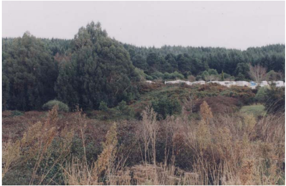
Photo 3 - View from Sewage Treatment Plant looking across the closed landfill area in foreground towards Campground.