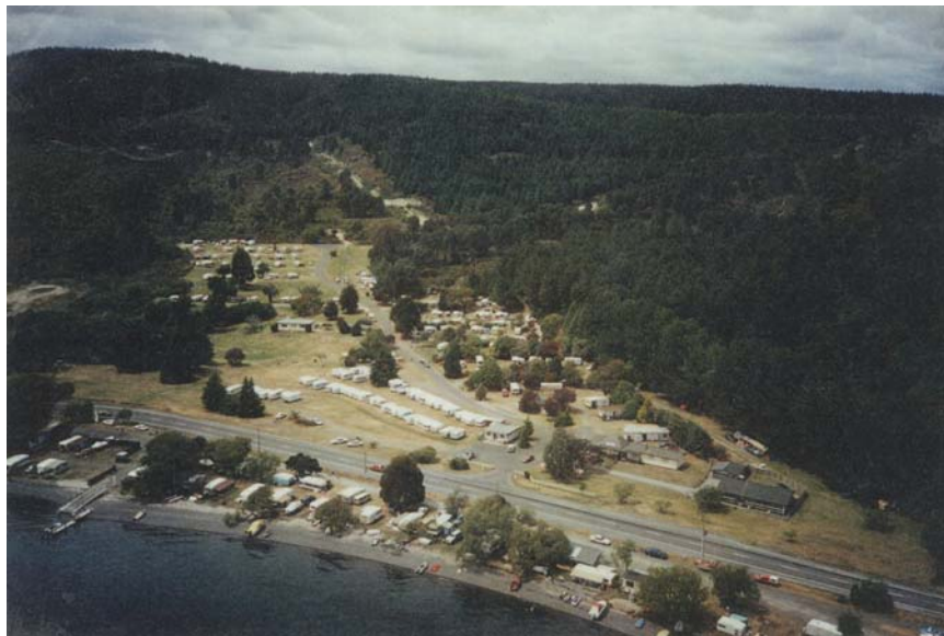
Photo 2 – Aerial oblique view from Lake Taupo showing campground with camping along Lake edge.