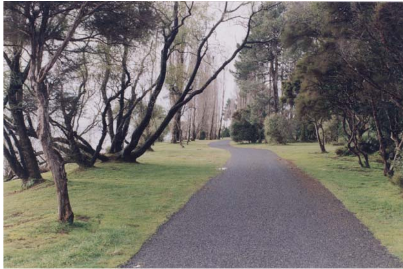
Photo 7 – Access Road to Passive Recreation area in Mission Bay looking north towards historic canoe landing site