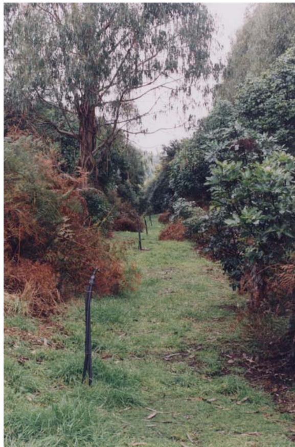
Photo 4 - Spray irrigators for ground treatment of sewage effluent on Motutere Recreation Reserve land.