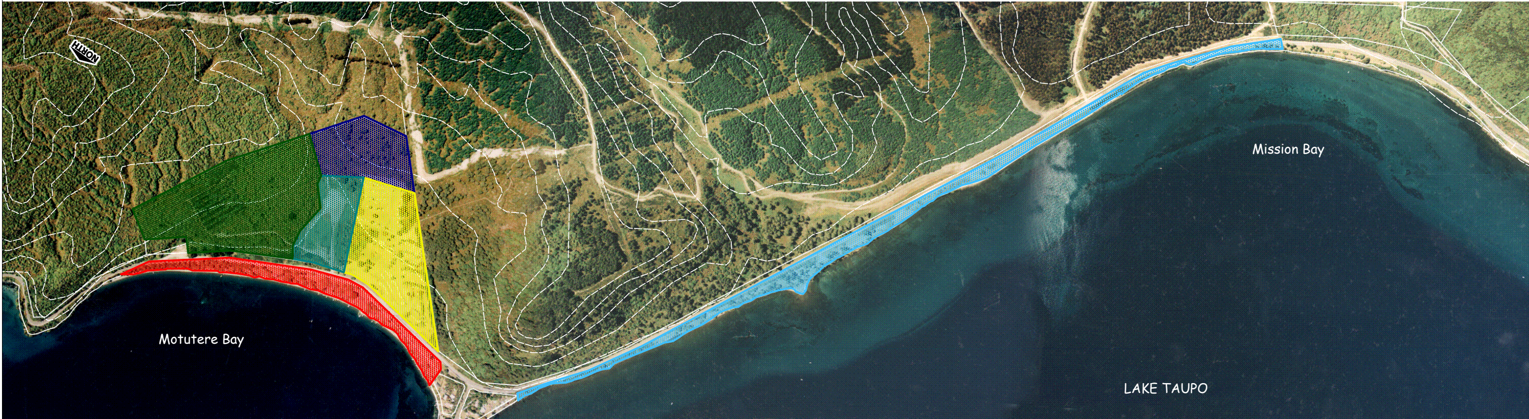
Aerial Photo showing Reserve Management Policy Areas